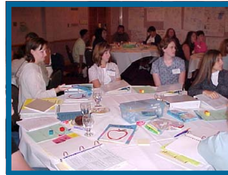
Beginning Teachers from Sylvan Union & Ceres Unified School Districts share space at a recent “Engagement” training.

Second-year BT’s have been working on a combined entry that