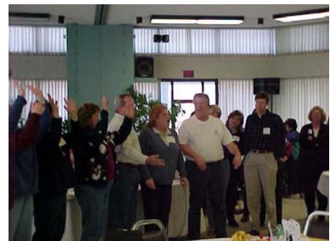
Salida team members performing for the group.